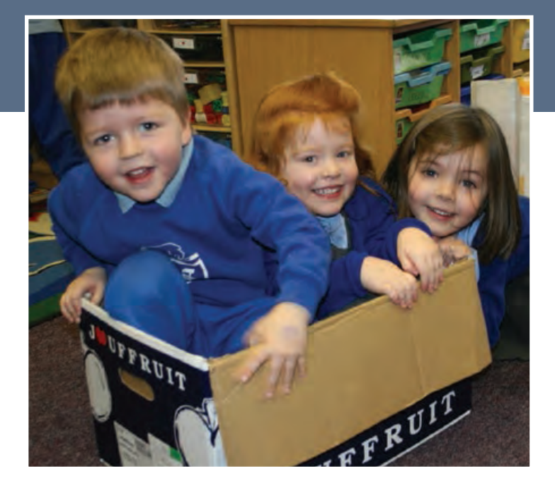
"Pupils' capacity for reasoning and independent thought is a strength of their learning. Their mathematical skills are very well developed and applied particularly well to investigations and problems"